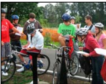
The Astronomy Class stops to observe along the solar system bike ride.