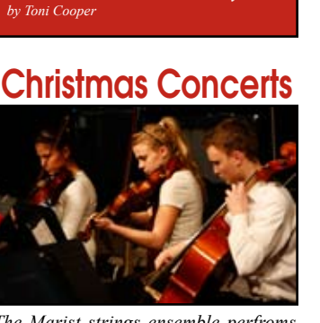
The Marist strings ensemble perfroms in the theatre on Wednesay night.