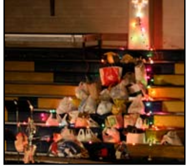
The school's donations are placed in a Christmas tree formation, celebrating both Christmas and the successful drive.

It was a wonderful way to begin the break. Merry Christmas everyone!