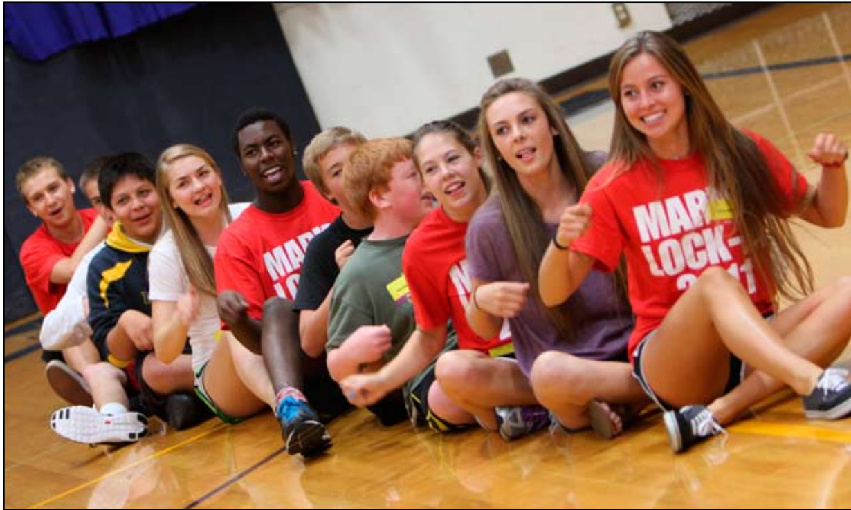
Freshmen and their leaders join in a fun game of Ships and Sailors last weekend at the Freshman Lock-In.

The Class of 2015 experienced spirited games, a memorable Mass and exuberant leaders at this year’s Freshman Lock-In