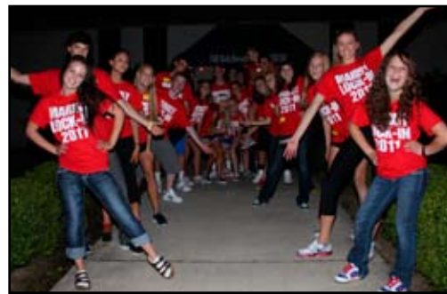
The upper-classmen leaders await the arrival of the freshmen.

After a quick breakfast the students were dismissed with the hope of catching a little sleep before school on Monday.