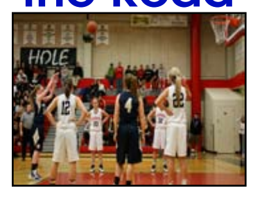
throw at Mountain View last Friday.