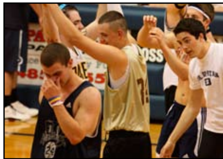
The Mr. Spartans celebrate after defeating the staff by one in the annual basketball game.