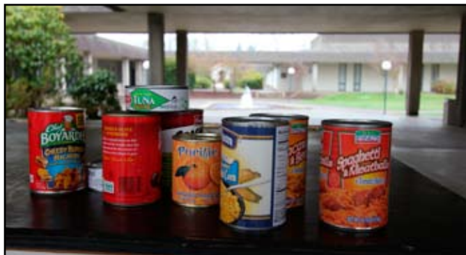
Donated canned food items will be handed out to members in need in our community.

St. Vincent de Paul picked up all collected food on Thursday. The food will be distributed to the community during the coming months.