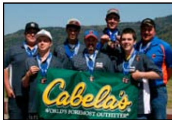
The shooting team poses in front of a range last weekend.