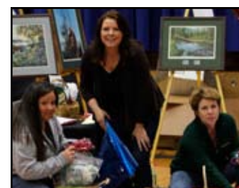
Marist moms prepare the gym for the auction Friday morning.

There will be 46 packages in the live auction starting at 7 p.m., including a father-son survival weekend, an opportunity to job shadow in the medical field, and an authentic replica of the Oregon Duck football helmets worn in the 2012 Rose Bowl. The auction committee hopes to raise at least $250,000 to secure Marist's future growth and success.