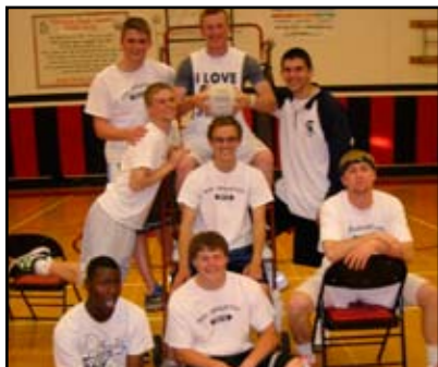
The Mr. Spartan team takes a break after the volleyball tournament at Thurston High School on Thursday.