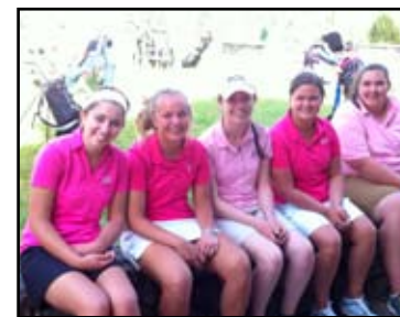
Left: The girls golf team at Tokatee on Tuesday, 2012 district champions.