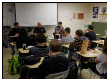
Students intently listen to the brown-bag lunch speakers.