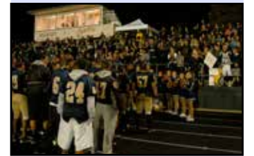
The football team, cheerleaders and fans all gather at the end of the game to sing the fight song.