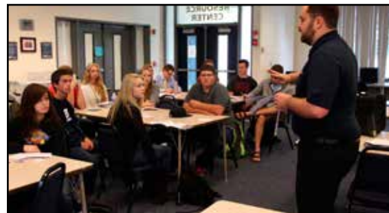
Seniors and juniors gathered in the ARC for an admissions presentation from Gonzaga University.