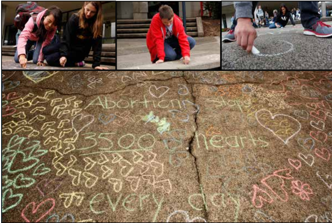
The Marist For Life Club gathered in the courtyard at lunch on Wednesday to draw bright chalk hearts to protest abortion. The message of the day was "Abortion stops 3500 hearts every day." The club was joined by many other students throughout the break who helped to draw 3500 chalk hearts on the concrete.