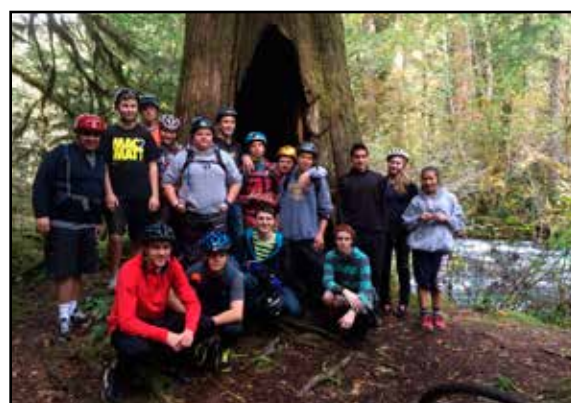
Student members and adult leaders of MOAP take a break from their bike ride by the McKenzie River.

The club members ate lunch along the river and soaked in the hot springs for an hour until it was time to head home.