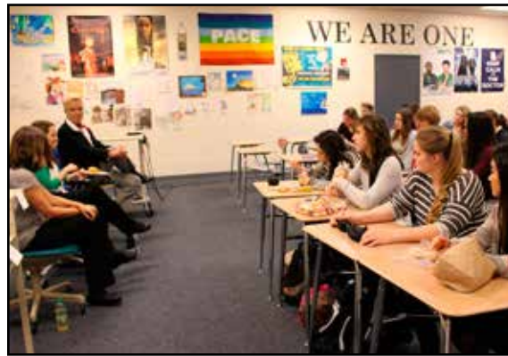
Students listen to guest speakers describe the work that they do in the medical field.