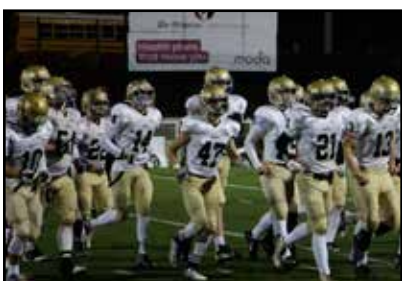
The football team jogs off the field at the end of the game.