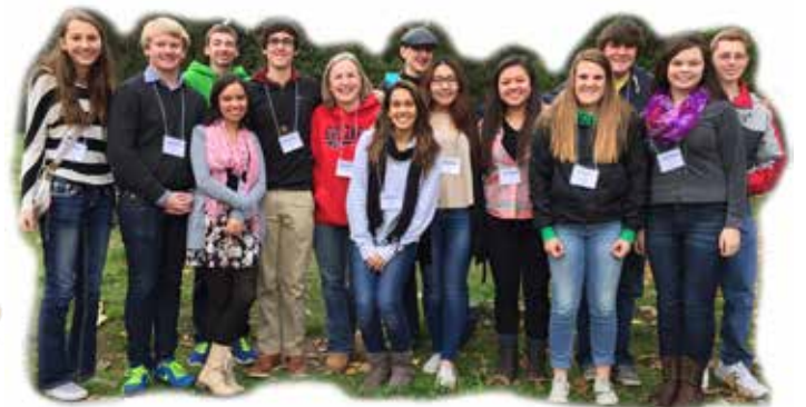
Love The Spartan Spear Staff