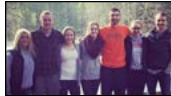
Marist Grads who get together for a picture in front of the McKenzie River.