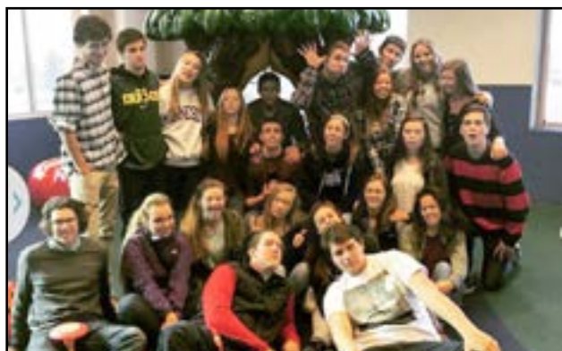
The Mr. Spartan team poses for a silly group photo in the open air playground at River Bend.