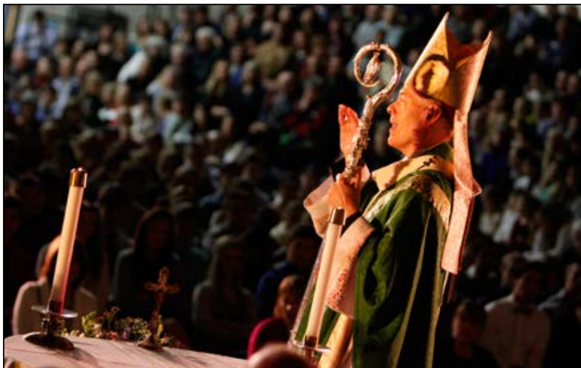
Archbishop Alexander Sample preaches to students, staff, and parents.