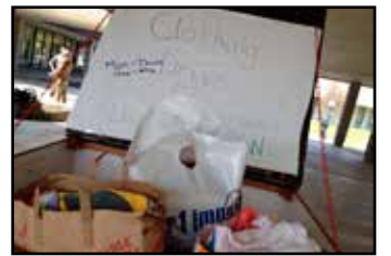
Clothing donations sit in the box outside of the school.