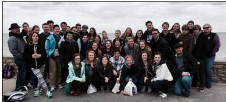
The Marist 2015 Spring Break Trip group.