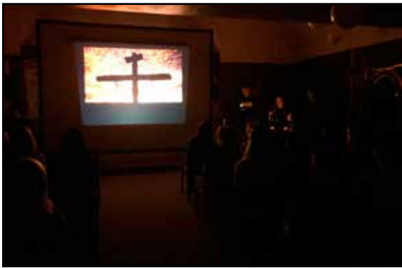
Christian Leadership students lead prayer services in the chapel for all theology classes this week.

The week drew to a close with an early release on Holy Thursday and no school on Good Friday in observance of the Catholic tradition of preparing for Easter.