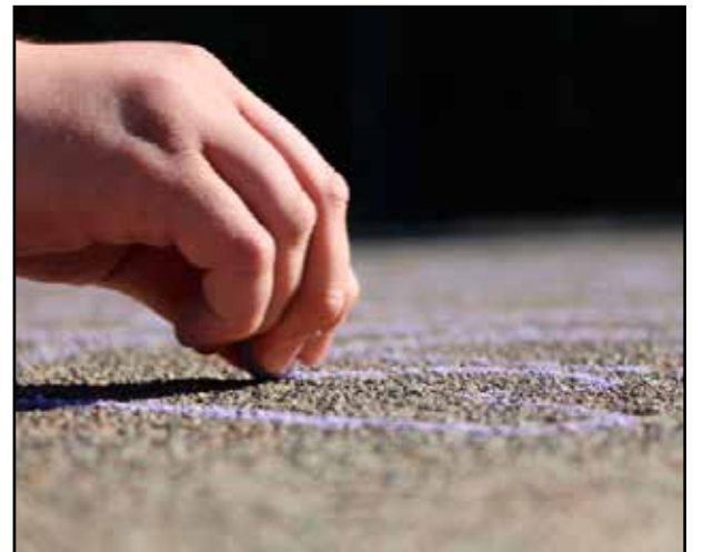
A Marist student draws one of many hearts in the Marist courtyard at lunchtime Tuesday to illustrate the 3,500 lives lost to abortion in the United States each day.