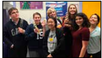
The speech and debate team celebrate after their tournament.