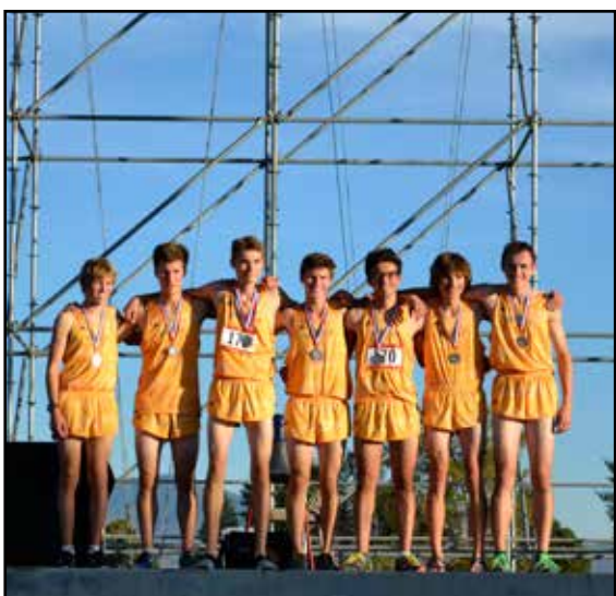
The varsity boys cross country team stands proudly after earning 2nd place at the Midwestern District Meet in Central Point, Oregon.