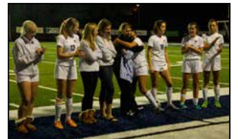
The senior girls varsity soccer players on Senior Night.

The water polo team lost to South Albany in Tuesday’s night’s senior recognition game. The Spartans will play in their last regular season game of the season against the Ashland Grizzlies this evening at 6:15 p.m. in Cottage Grove.