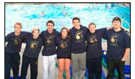
The senior water polo players on Senior Night.