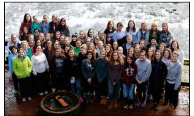
Junior girls, retreat team members and faculty stands together next to the McKenzie River.

Retreats are an opportunity to escape from the stresses of everyday life, which is often easier in the presence of a natural beauty such as the McKenzie River.