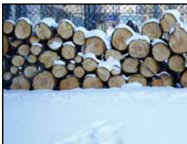
Chopped wood from trees on campus sits in the snow. Marist lost several trees during the ice and snow storms.

The Marist campus sustained an estimated $5,000 worth of damage during the various ice and snow storms. Former Marist parent and