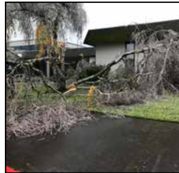
A tree broken on Marist campus. The ice storm took down many trees at Marist, but also across the Eugene-Springfield community.