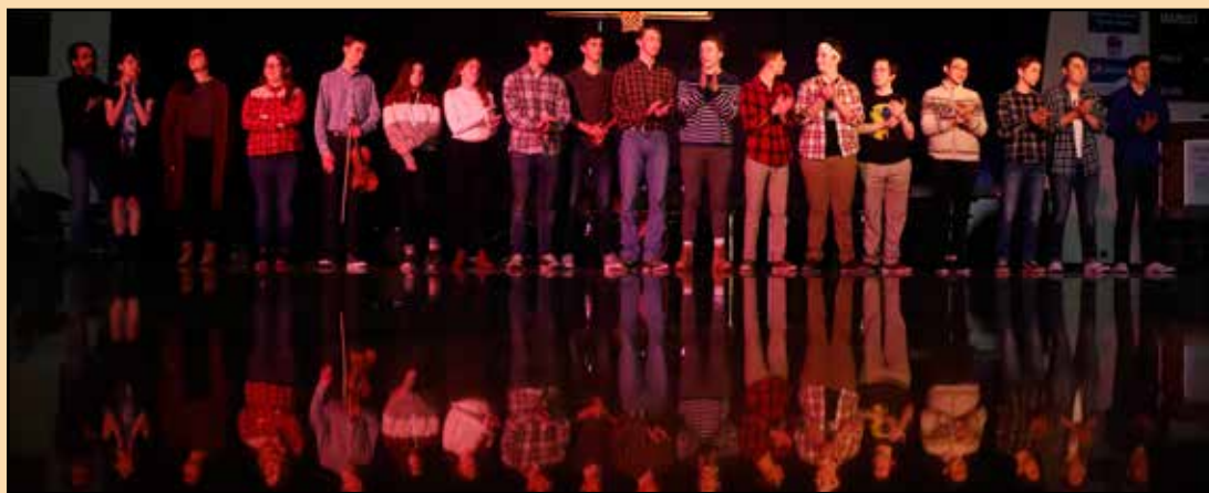
Performers of the 2018 Annual Marist Talent Show line up as they await the results from the panel of judges.

Students share their gifts and shine at the Annual Talent Show