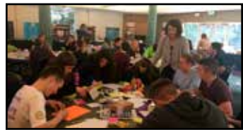
Marist for Life students draw during a small group activity at the Leadership Workshop.