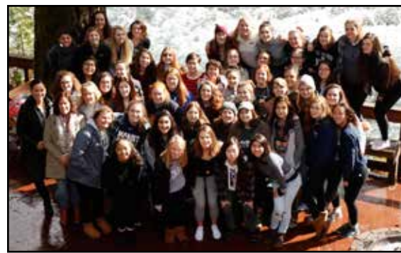
Second Junior Women's Encounter 2018.

"I found rectoring the Encounter to be a very re-