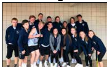
2018 Mr. and Ms. Spartans pose for a picture after the activity night at Pleasant Hill High School.

Mr. Spartan participants joined together last Saturday with baby-saving teams from other local high schools at Pleasant Hill High School to raise money for each school's program.