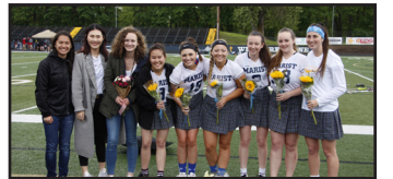
Senior lacrosse girls and managers pose before their 11-6 victory over Thurston.