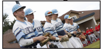
Seniors catch the first pitch from their fathers as a tradition of Marist baseball's senior night.