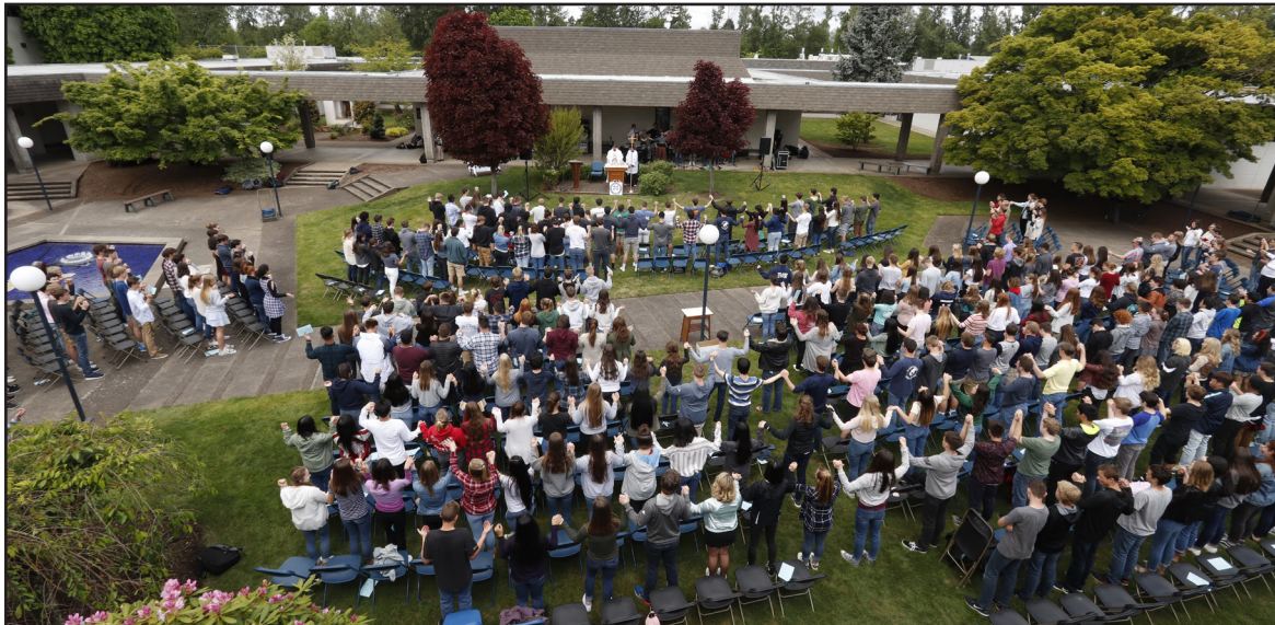
Marist students, staff and guests link hands during the Our Father.