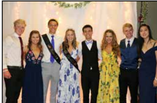
The 2018 Prom Court.

Not only did students break it down on the dance floor, they also had fun playing games set up in the back for playing cards, giant jenga or cornhole.