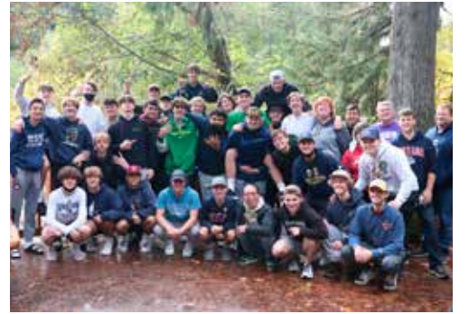
The 2021 Fall Men's Encounter

from Nov. 20-22. The deadline to sign up is Friday Nov. 5. Go to the Campus Ministry Office for a sign-up form.