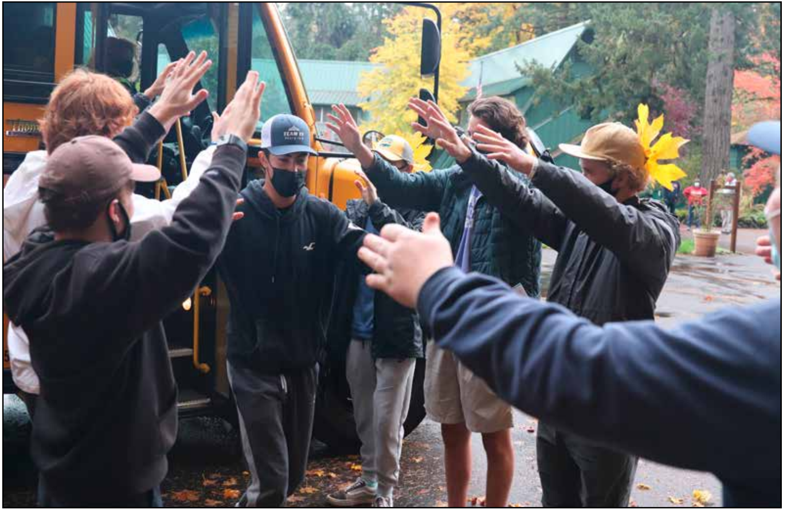
The Marist men welcome each other to the Saint Benedict's lodge for their Fall Men's Encounter.