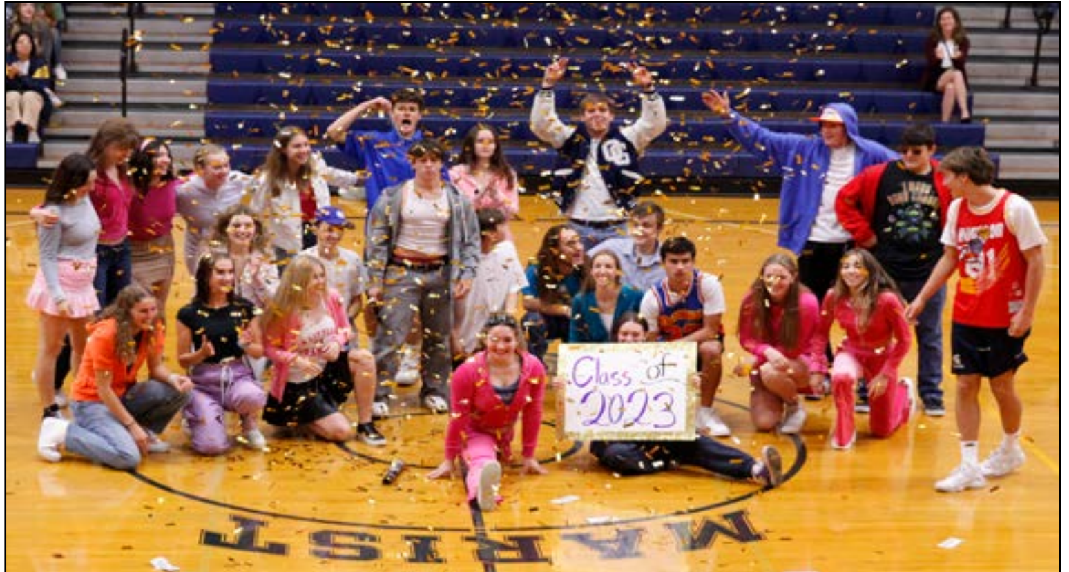
Seniors strike a pose after their 2000's decades dance performance this Tuesday.