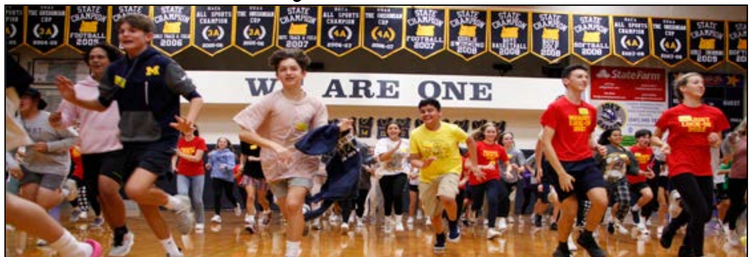
Freshmen and upperclassmen leaders participate in a game of Simon Says at the 2022 lock-in.