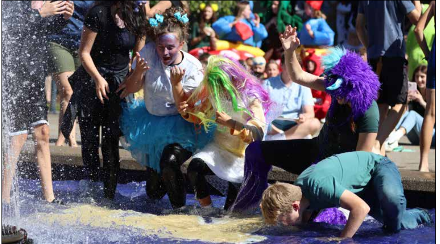
Members of the class of 2027 Kiss the "M" on Wednesday afternoon during the welcome week festivities.

Rituals new and old welcome the class of 2027 into the Marist community