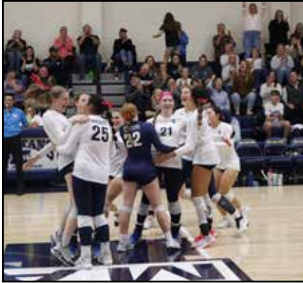
The Marist volleyball team celebrates their win against the No. 1 ranked Marshfield.

A battle for 4A volleyball's top spot took place last Tuesday between the No. 2 ranked Marist Spartans and No. 1 ranked Marshfield Pirates. Predicted by the Spartan Spear as the game to watch, students packed the stands and the game did not disappoint. The Spartans set the tone winning the first match but Marshfield winning the next, evening the score. Both gained another win, leading into the tiebreaker. Shots were taken from either side, and Marist emerged victorious topping Marshfield 3-2, with a final set win of 15-13.