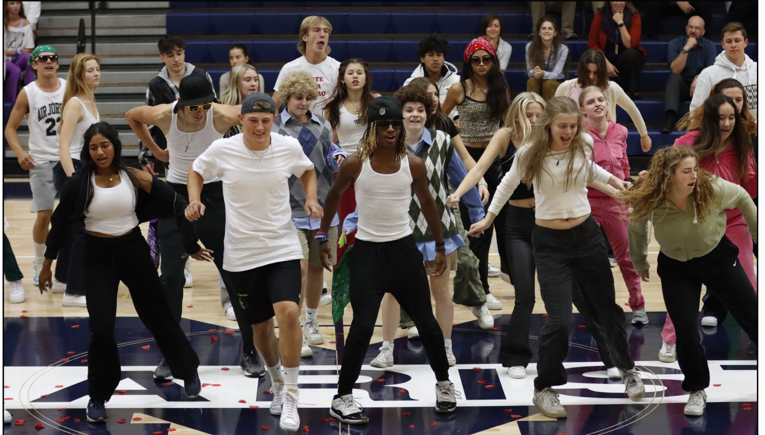
The seniors dance during their class dance on Tuesday, securing them in first place.

Students show off their dancing skills during the class dance competition.