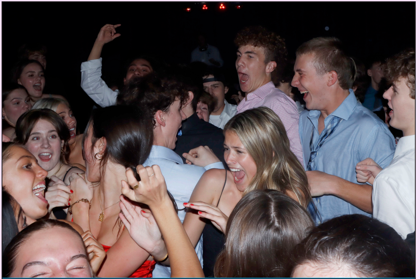
At last Friday's winter formal, students packed into the gym for a night of dancing and fun, complete with a DJ and photo booth. The dance was hosted by the student council and also marked the third annual Sadie Hawkins dance, in which the girls asked boys with creative signs.