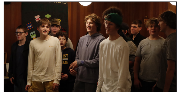
Sophomore boys gather in the chapel to share songs.