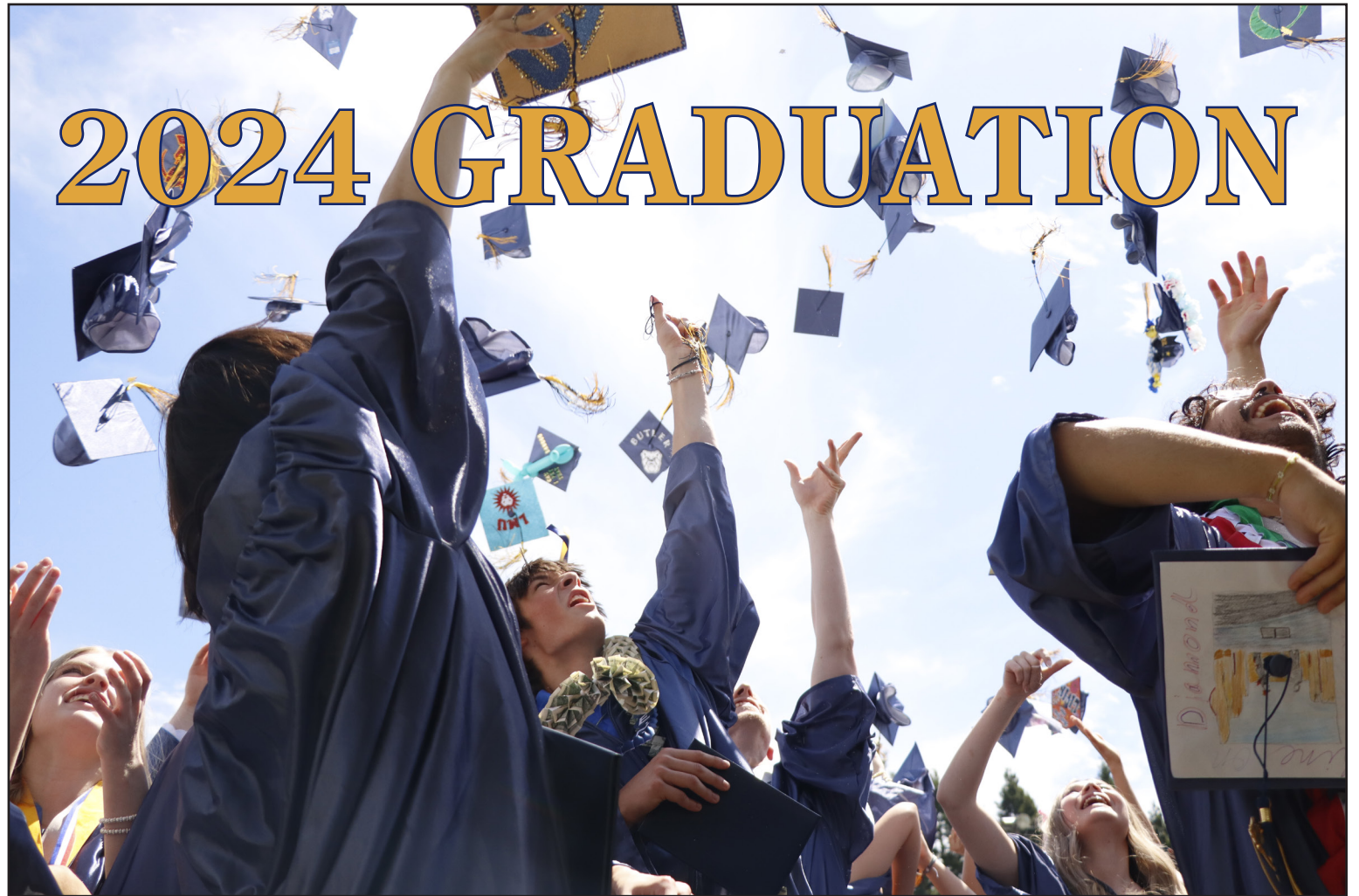
Seniors throw up their caps at the end of the 2024 Graduation Ceremony.