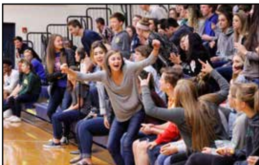
Seniors celebrate before dodgeball at the Spring Pep Assembly today.

Today after seventh period, class meetings were held in the gym, cafeteria, theater, and ARC. For the juniors, sophomores, and freshmen, the meetings included announcements and speeches for students applying for class council. Seniors discussed prom and details about the upcoming homegoing events.