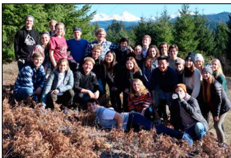
A group of seniors enjoys a hike during free time on the Metanoia.

heart" in Greek. The Metanoias give senior students the chance to get to know classmates they hadn't talked to before and rekindle old friendships that may have faded.