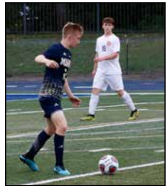
during the varsity game against Junction City.