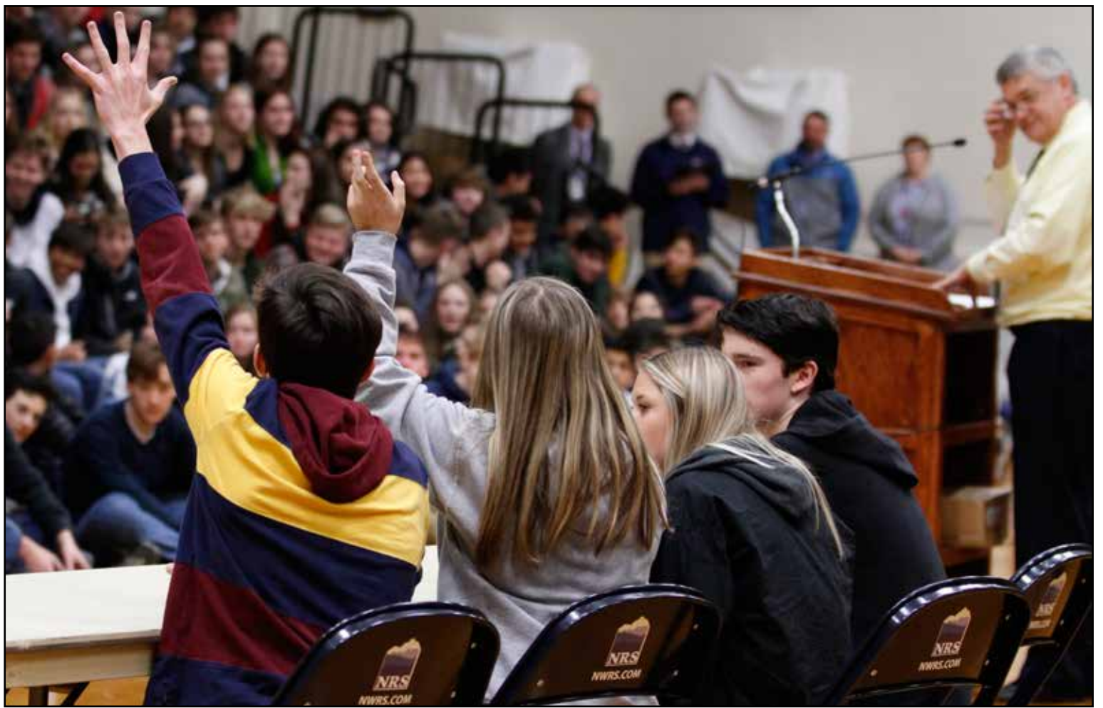
The junior Trivia Bowl team excitedly raise their hands to answer the question first.