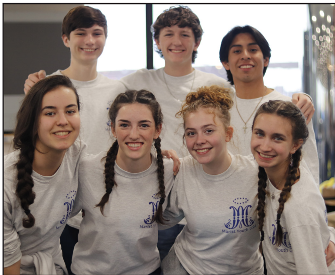
Sophomores at the Marist Youth Mission Conference.